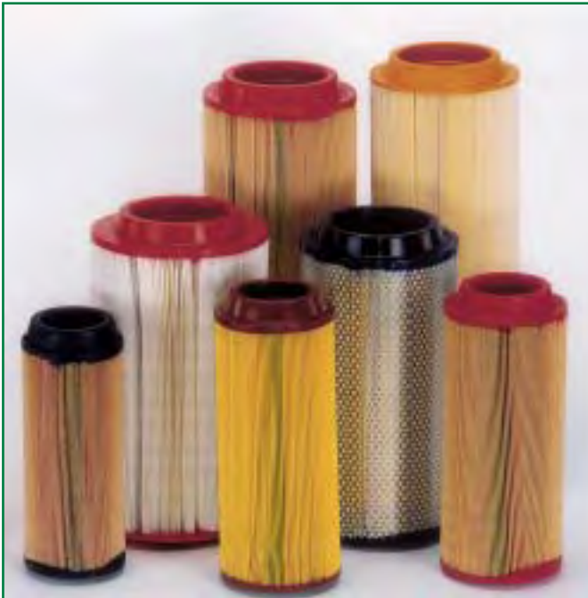
Inferior copies – high risk

Original products have always been copied by pirates and offered at lower prices. But a farsighted operator of a compressed air system will know that copies are products with an inferior quality which do not fit properly and force running costs up. Indeed they endanger the economic running of the compressed air system. In the worst case copies can lead to shutdown of the compressor.