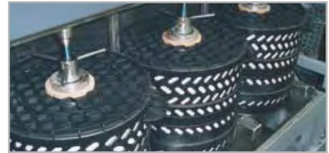
H 34 1290/3