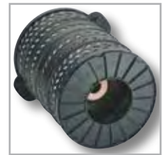
H 34 1790 with conical clearance