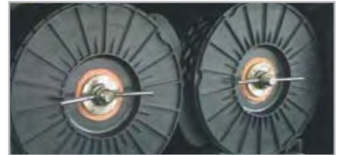
H 34 1790