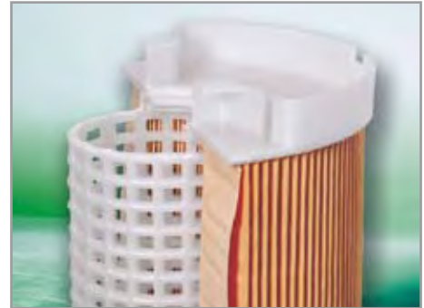
Complete metal-free element