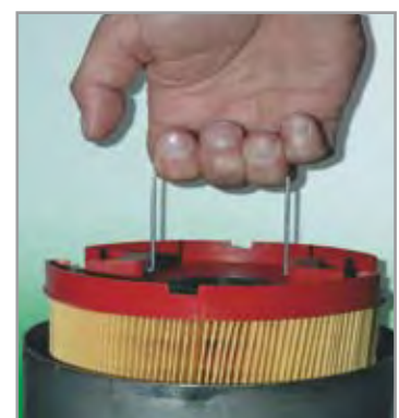
Optional reusable handle