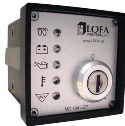
Pictured Above: MC704 LCP Micro Panel