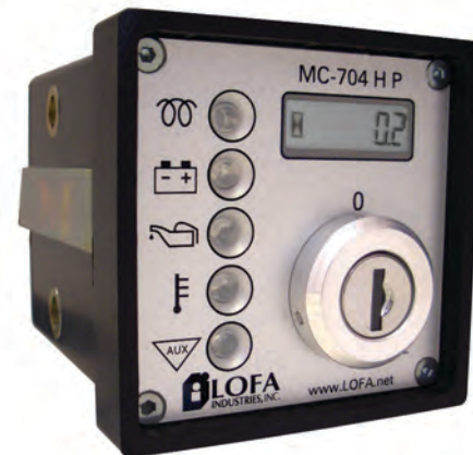
Pictured Above: MC704 HP Micro Panel

The standard panel includes a 12" wiring harness terminating into a sealed weather proof plug. This wiring solution offers a robust wiring connection that performs well in harsh environments. This wiring design allows for simplified installation as well as a flexible means to incorporate custom plug and play engine wiring harnesses and standard harness extensions.