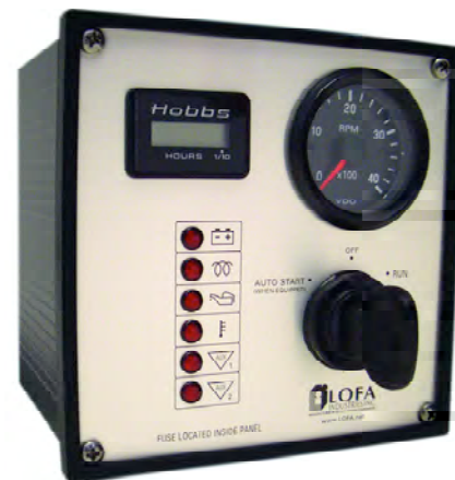
Pictured Above: EP250 G1