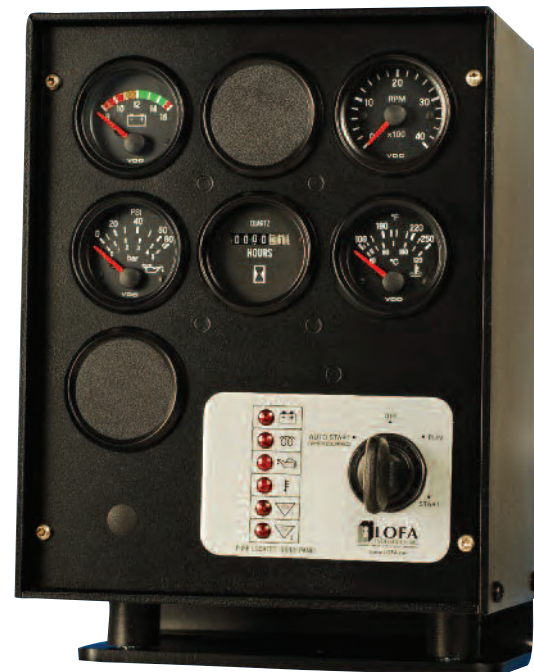
Pictured Above: EL240 G7

The EL240 series panel is a flexible platform for mechanically governed diesel engine control, monitoring, and protection, featuring LOFA's powerful First Fault Diagnostics (FFD). After pinpointing the initial failure, FFD stores the shutdown in memory and alerts the operator, via a single bright LED, of the exact cause of the failure. This feature helps identify failures quickly and reduces downtime for the customer. The microprocessor-based solid-state design uses reliable high-power semiconductors rather than outdated electromechanical relays.