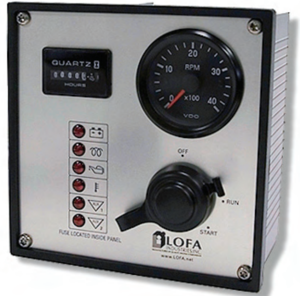
Pictured Above: EL240G1HS

The standard system includes a 12" wiring harness terminating into a sealed weatherproof plug. This durable connection performs well in harsh environments and provides efficient installation of custom plug and play engine harnesses as well as standard harness extensions.