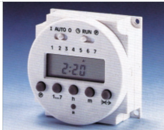
24 Hour/7 Day Timeswitch

Popular applications include: Heater filters, pumps, fans, signs, blowers, indoor and outdoor lighting, feeders, security/alarm systems and process controls.